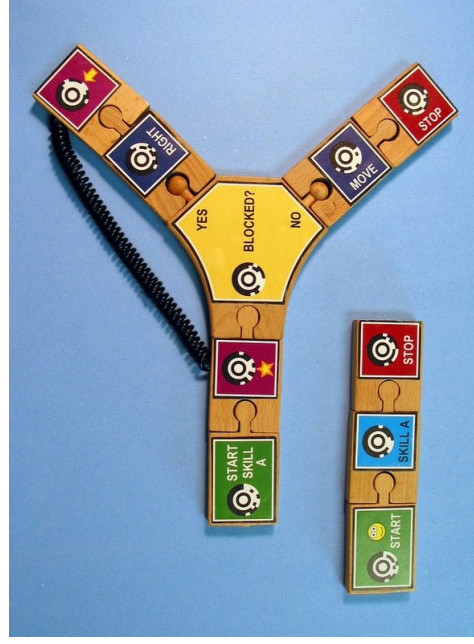
figure 5. This program includes a conditional branch, a loop (represented by coiled wire), and a subroutine.

right first. Special JUMP and LAND statements allow the introduction of loops into a program's flow-of-control. These statements are connected by coiled wire that represents the flow of execution as it moves from the JUMP statement to the LAND statement. This construction is similar to a GOTO statement in a text-based language. Tern also offers structured loops that provide more controlled iteration. Like Karel the Robot, Tern includes the ability to create subroutines called Skills . Skills can be defined using a START SKILL block and can be invoked using a skill action block (see figure 5).