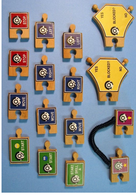
figure 1. Tern consists of a collection of wooden blocks shaped like jigsaw puzzle pieces.

Tern is based on the text-based language outlined in the book, Karel the Robot: A Gentle Introduction to the Art of Programming [6]. With Karel the Robot, students write simple, Pascal-like programs to navigate a robot through a grid world. We chose this language as a starting point because of its simplicity—it has no variables, no parameter values, and a small set of primitives. Like Karel the Robot, Tern programs also control robots that inhabit a grid world on a computer screen (figure 2). We altered the Karel model to allow multiple robots to interact in the same world, thus allowing several teams of students to participate in a shared classroom experience.