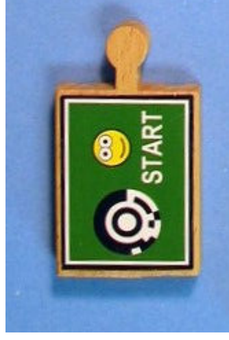
figure 4. START statements can only be connected at the beginning of a flow-of-control chain because they have no incoming jigsaw puzzle connector.

In the design of Tern we sought to minimize the possibility of creating programs with syntax errors. The shape of the blocks provides a physical constraint system that prevents many invalid language constructions from being assembled as physical constructions. For example, it is impossible to connect a STOP statement in the middle of a flow-of-control chain. It can only be attached at the end because it lacks an outgoing jigsaw puzzle connector. In a similar way, START statements can only be connected at the beginning of flow-of-control chains. Some syntax errors are still possible—leaving one statement disconnected from the others in a program is an example. When a syntax error occurs, the compiler displays a picture of the original program, an error message, and an arrow indicating the location of the problem.