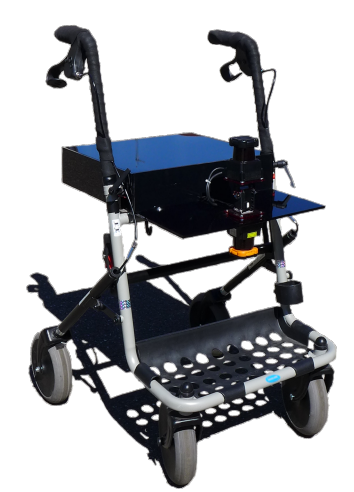
Fig. 1. The smart walker, a modular system composed of a standalone processing unit and an off-the-shelf walker. The processing unit includes two laser scanners and the required computing capabilities. The lower laser scanner is fixed and used for egomotion estimation. A servo motor tilts the upper scanner continuously up and down to acquire a three-dimensional representation of the environment.

Our system consists of a standard off-the-shelf walker, retrofitted with sensors and data-processing capabilities. The sensing and processing unit is built in a modular fashion, such that it can be easily mounted on different walker brands. The system additionally includes a vibration belt comprising five vibrating motors, which provide haptic feedback to the user. An image of the smart walker is shown in Figure 1, while Figure 2 depicts the vibration belt.