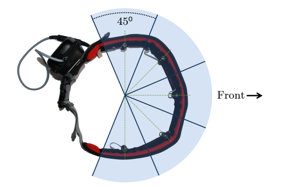
Fig. 2. Vibration belt with bluetooth receiver and power supply. Five vibration motors are mounted around the user's waist. The vibration pattern of each motor encodes the distance to the closest obstacle within the marked angular range.